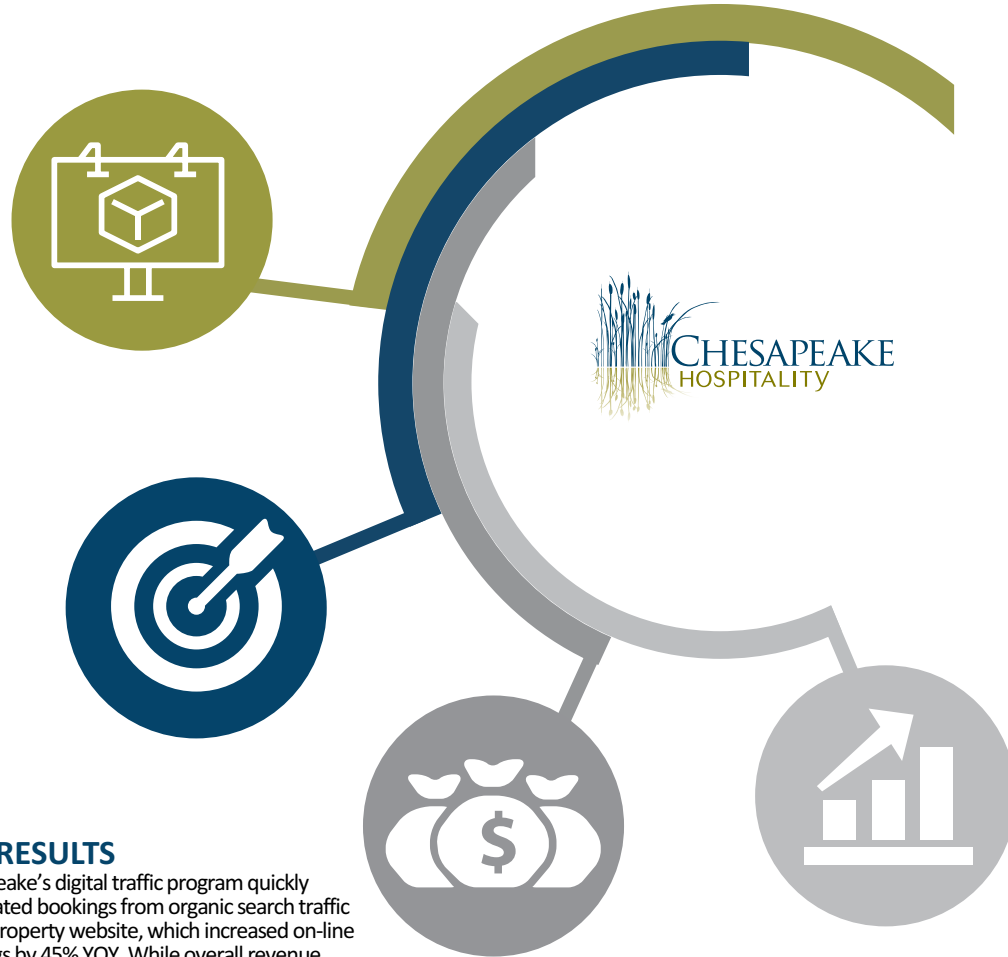
ROOM REVENUE GROWTH

Chesapeake accomplished their growth without any renovation capital investment. The owner was impressed and has committed to major renovation of the Hotel's rooms and public space in 2017 and 2018 to drive further revenue growth.